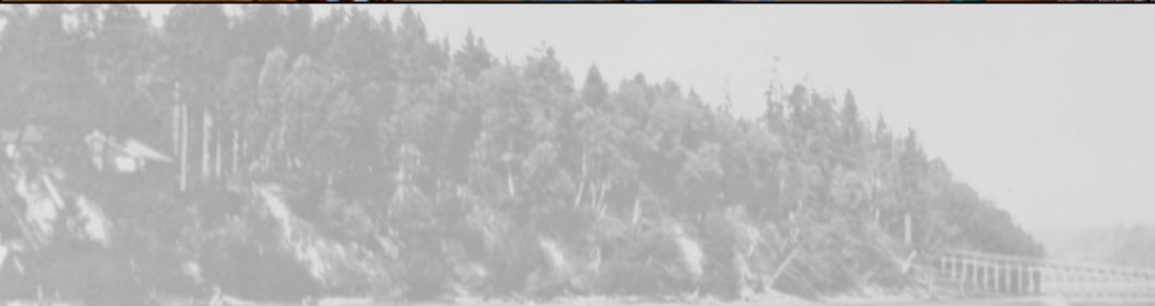
Past view from home. Date unknown.